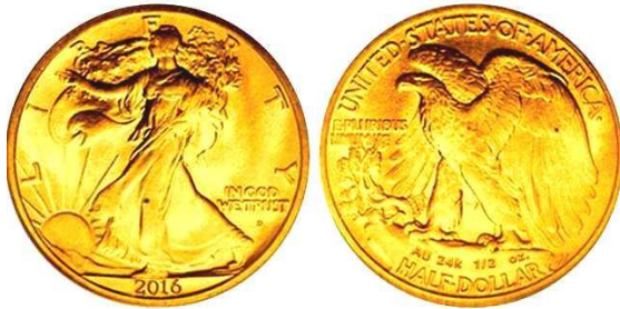
Shown is an early mock-up of what the gold 2016 Walking Liberty half dollar might look like. It is to be struck in half-ounce .9999 fine gold.

The United States Mint announced in November with plans to issue centennial editions in 2016 of the Winged Liberty Head dime, Standing Liberty quarter dollar and Walking Liberty half dollar in .9999 fine gold.