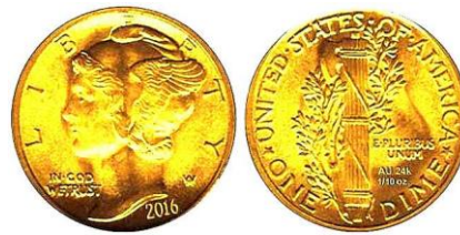
Early mock-up of the 2016 Winged Liberty Head dime that will be struck in tenth-ounce, .9999 fine gold. Images by U.S. Mint.

"The Mint will use gold from its working stock gold reserves for initial production of these coins, to allow production without substantial purchases in the market prior to sales," Jurkowsky said. "The Mint will purchase replacement gold upon issuing the coins."