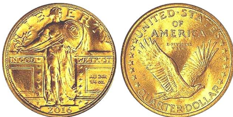
Sculptor Hermon Atkins MacNeil's Standing Liberty quarter dollar is one of three U.S. coins originally issued in 1916 in silver to be produced in .9999 fine gold centennial versions in 2016.

When Mint officials announced plans in June 2015 outlining the initiative for the gold commemoratives, the bureau did not have the formal approval from the Treasury secretary or his designee to move forward.